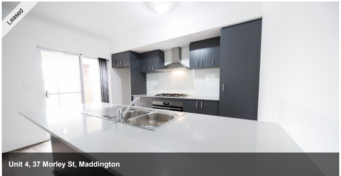
Unit 4, 37 Morley St, Maddington