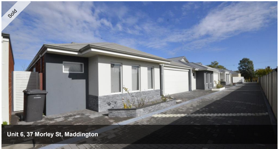
Unit 6, 37 Morley St, Maddington