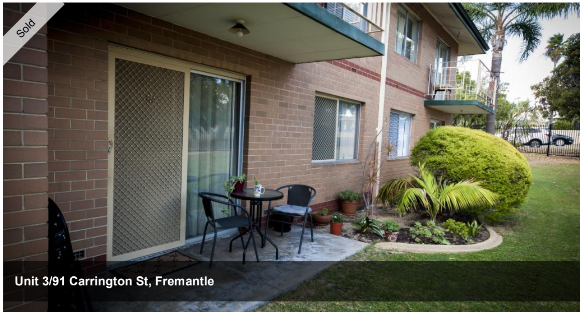
Unit 3/91 Carrington St, Fremantle