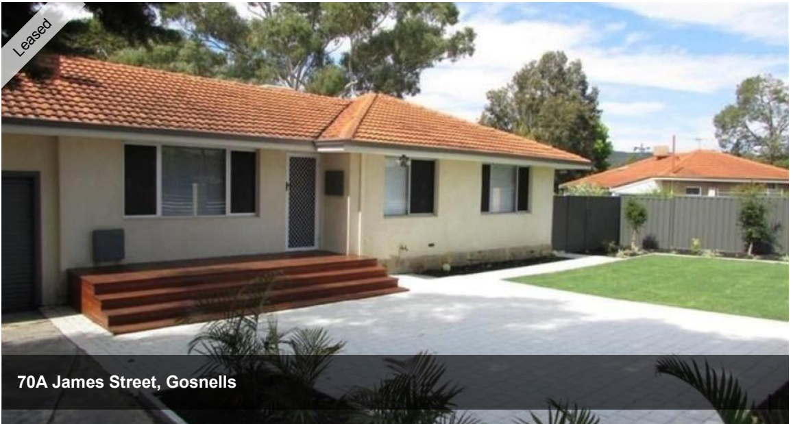
70A James Street, Gosnells