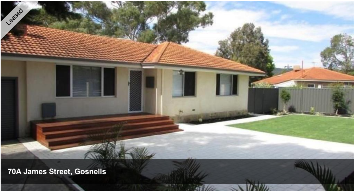
70A James Street, Gosnells