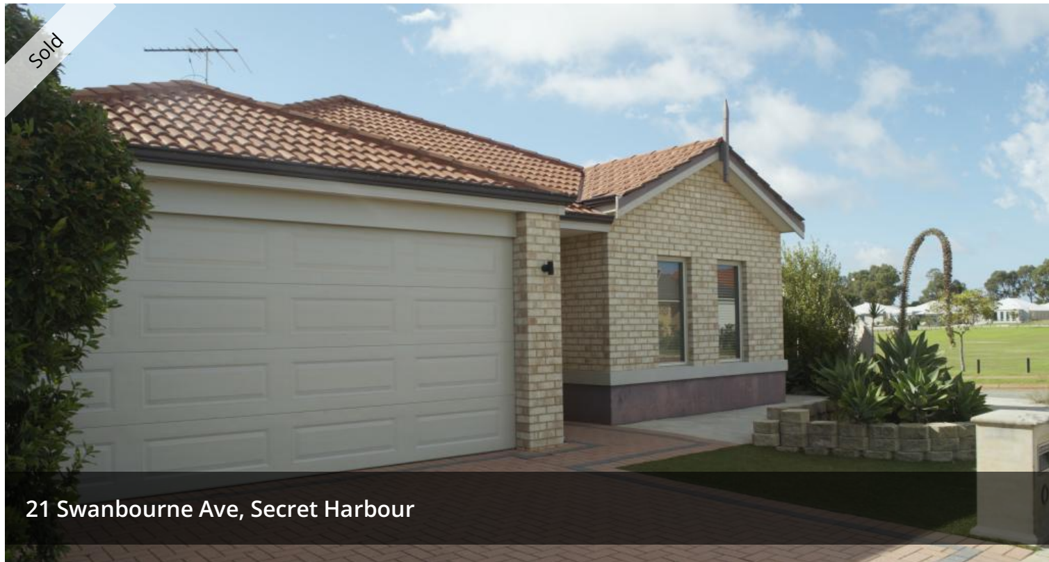
21 Swanbourne Ave, Secret Harbour