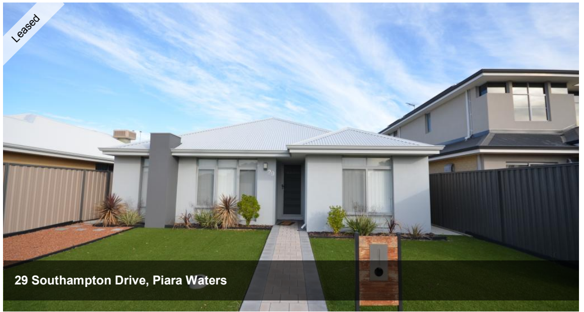
29 Southampton Drive, Piara Waters