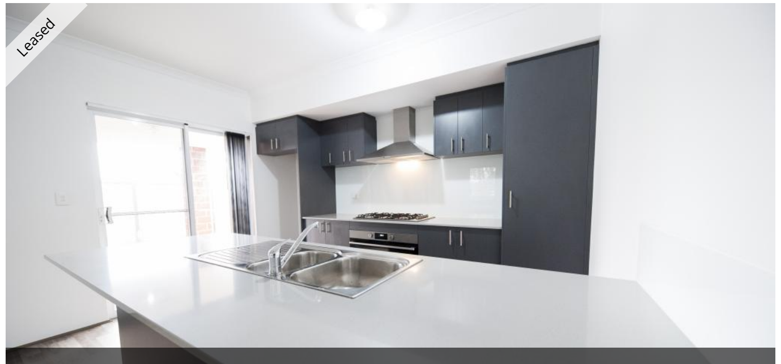
Unit 4, 37 Morley St, Maddington