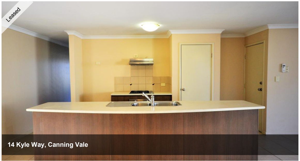
14 Kyle Way, Canning Vale