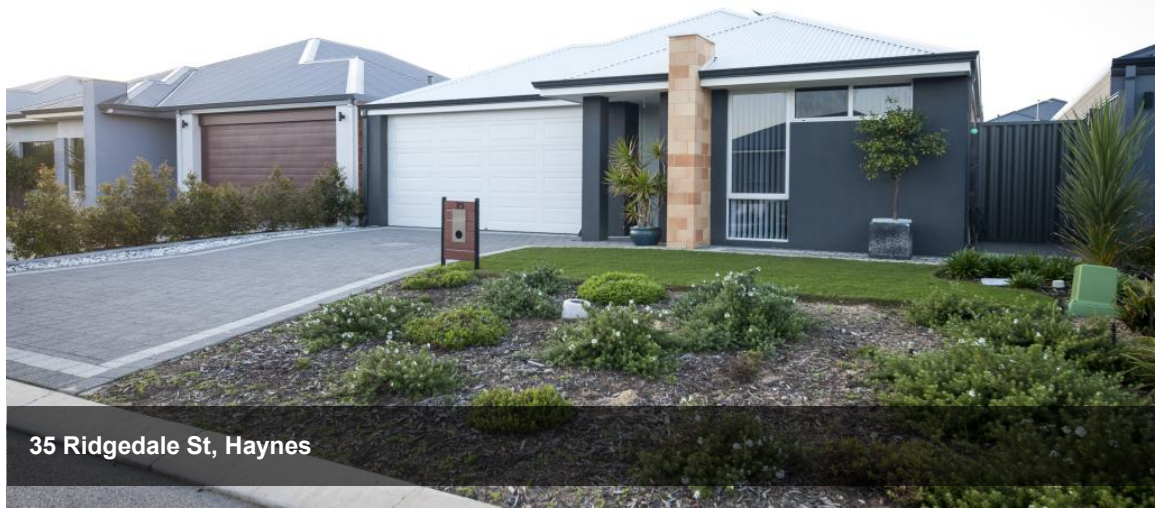
35 Ridgedale St, Haynes