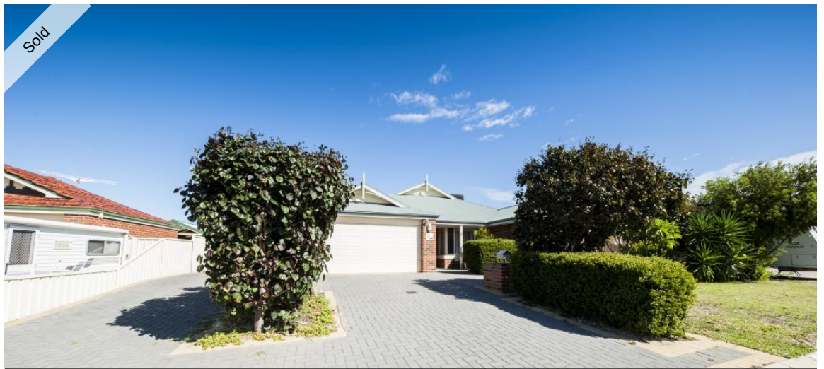
8 Pipe Lily Dr, High Wycombe