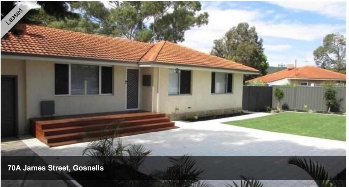
70A James Street, Gosnells