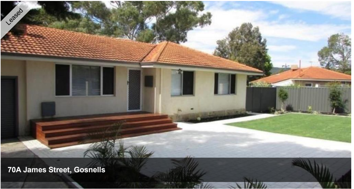
70A James Street, Gosnells