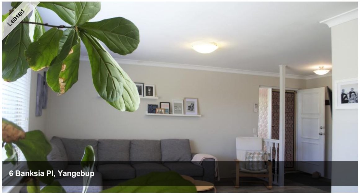
6 Banksia Pl, Yangebup