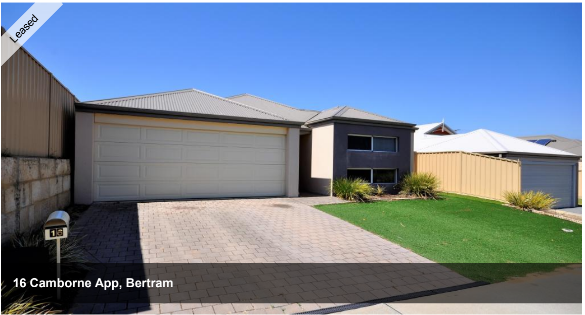
16 Camborne App, Bertram