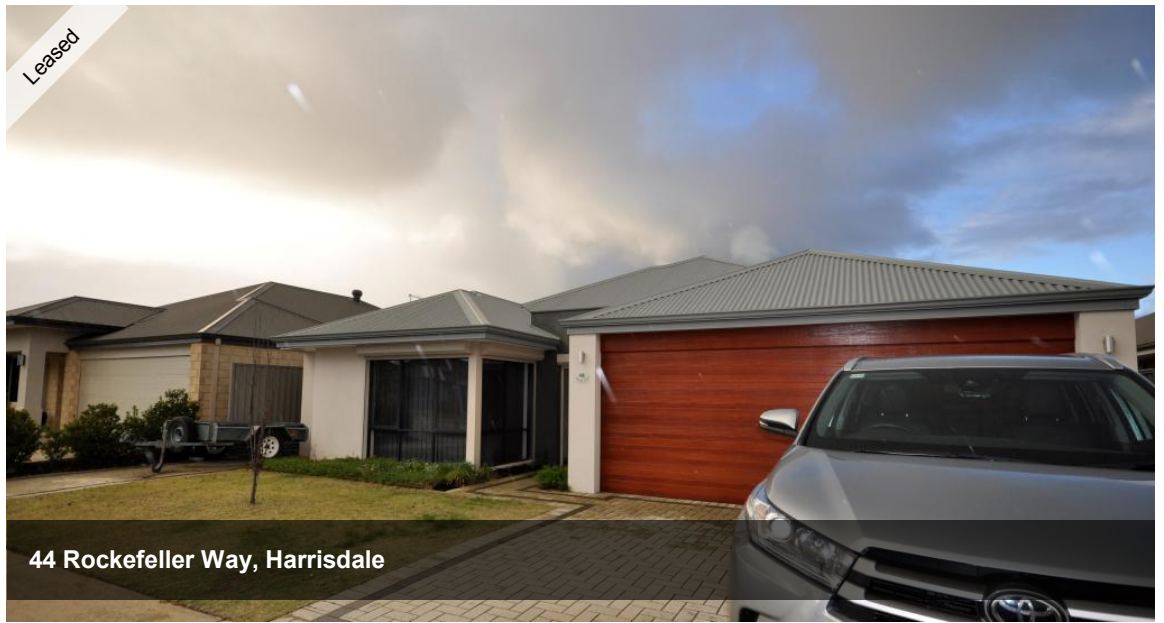
44 Rockefeller Way, Harrisdale