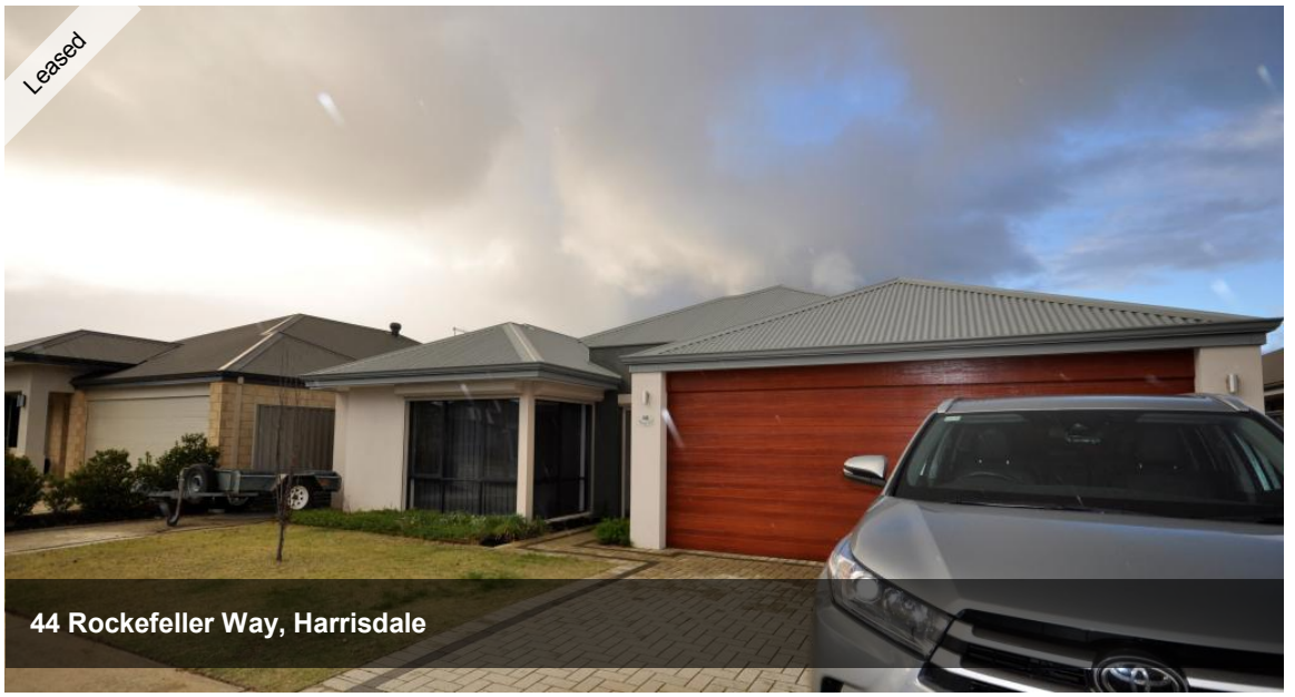
44 Rockefeller Way, Harrisdale