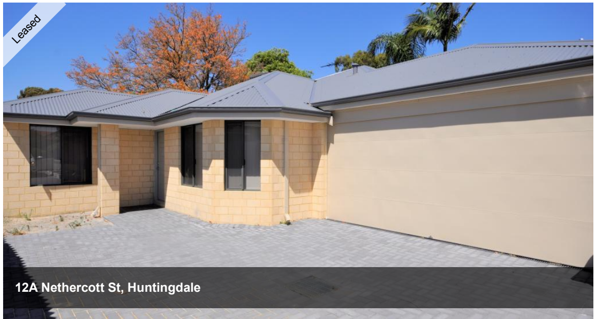
12A Nethercott St, Huntingdale