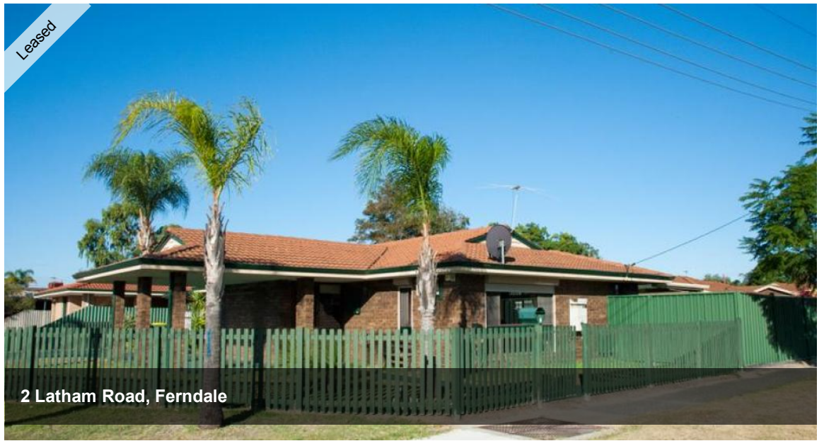
2 Latham Road, Ferndale