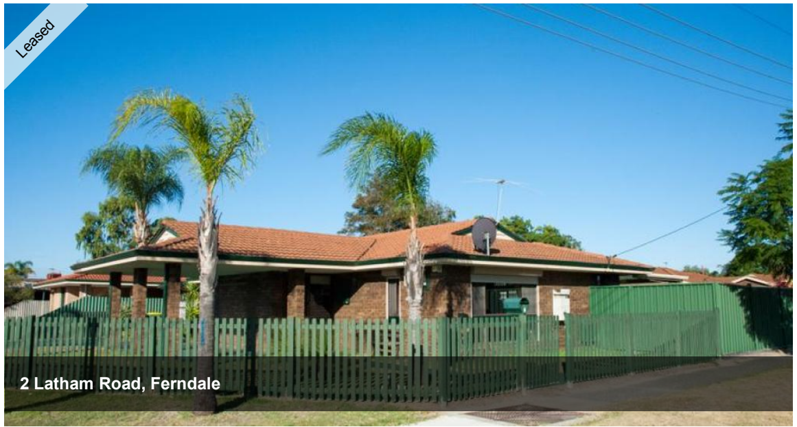
2 Latham Road, Ferndale